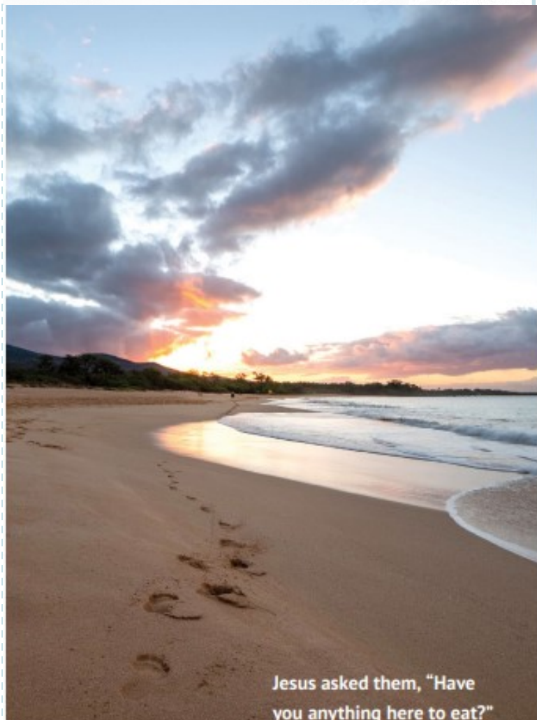
Jesus asked them, "Have you anything here to eat?"