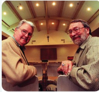
A candidate and his sponsor sit for a photo after an Order of Christian Initiation for Adults (OCIA) class.

I was baptized as a baby, but I never really went to church. Lately, I've been attending Mass. Are there steps I should take before I receive Communion? The first step is to celebrate the sacrament of reconciliation (confession). This is a wonderful opportunity to be officially welcomed back into full practice with the Church. After such a long absence, it is important to examine your conscience and celebrate the forgiveness of the Lord before you receive holy Communion. I would also recommend that you "beef up" your understanding of what it means to be a practicing Catholic. You might do this by participating in your parish's process for the Christian Initiation of Adults (called OCIA or sometimes RCIA). The Liguori Publications program, Journey of Faith, is one resource used by many parish communities. Another possibility is to use some of the resources offered online, such as Bishop Robert Barron's Word on Fire website, which has a fine reputation. I am happy you have responded to the stirrings of the Holy Spirit within you and answered the call to deepen your spiritual practice and journey. The Church needs you. The people of God welcome you. You are beloved among us, and your response in faith is a powerful witness, a reminder to those who may be tempted to take for granted the gift of faith. Thank you.