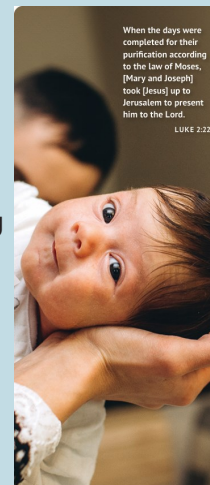
When the days were completed for their purification according to the law of Moses, [Mary and Joseph] took [Jesus] up to Jerusalem to present him to the Lord. LUKE 2:22

It is always a blessed and holy occasion when parents bring their child to the parish church for baptism. They gather family and friends and proudly present their child to both God and the faith community. Somewhere in the midst of it all, they will wonder who their child will become, what their child's gifts and talents will be, and what hopes and dreams their child will have. Yet like Simeon, who blessed the Holy Family in the Temple, they will also realize that life is not always favorable to us. As Simeon foretold, "Behold, this child is destined for the fall and rise of many...and you yourself a sword will pierce" (Luke 2:34–35). Although we recognize that suffering is a part of everyone's life, and we would never wish it upon a child, we might hope that the child does not run from every suffering, for it becomes the path to wisdom and compassion—perhaps the only path. We might also wish on the child a bit of loneliness, for it teaches us to treasure friends. And amid hoping for the blessing of success, losing can also be a gift and a blessing, for it is how we learn to deal with failure and understand the important lesson that we cannot always have our own way. Failure can be the seed of humility. Fortunately, while doing our best as parents, we must allow God to decide how our children will be blessed and what will nurture their growth into the image of Jesus. We simply present them to God from whom they came.