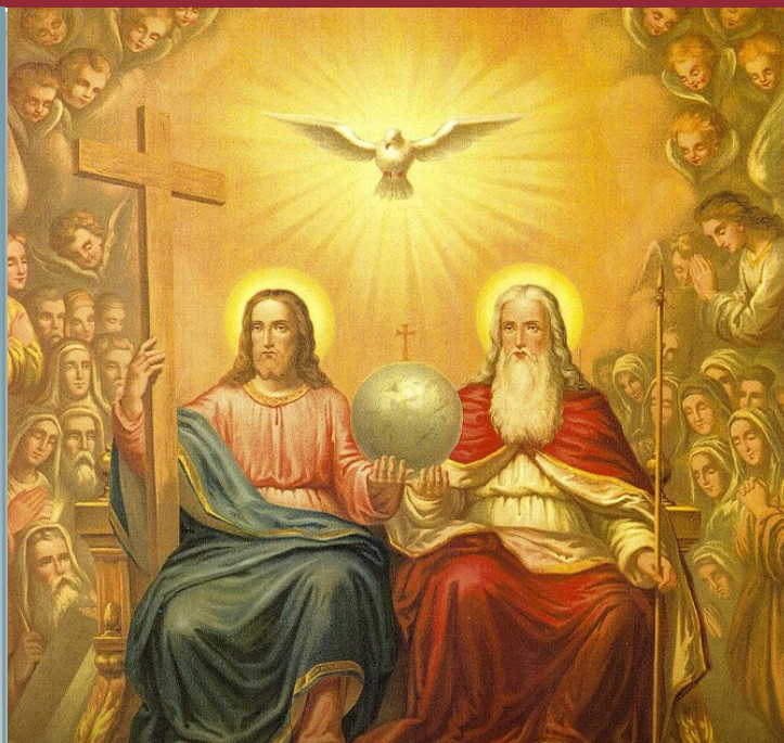
Most Holy Trinity