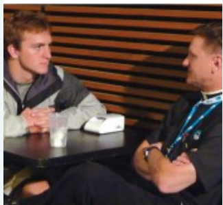
1 takes time during a World Youth Day event to speak about vocations.

Our Catholic understanding of vocation is “a call from God to a particular state in life,” by which is usually meant single, married, priest, or religious. When you hear people speaking about finding their vocation, it is possible that this is what they have in mind. On the other hand, it is also quite possible that they are referring simply to a particular occupation that they feel comfortable with and wish to pursue.