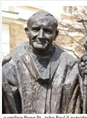
a smiling Pope St. John Paul II outside Cathedral in Trnava, Slovakia.