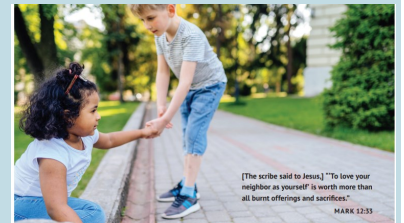
[The writer said to Jesus:] "To love your neighbor as yourself" is worth more than all burnt offerings and sacrifices." MARK 12:35

"I never met a man I didn't like." Will Rogers said that. I can believe he said it, but I have a more difficult time believing he meant it. I don't think he lied. I just find it hard to believe there could be a person who never disliked anyone. Loving is something different, although there are many people who talk as if liking and loving are interchangeable. They love ice cream or country music, and they like their friends. One can love, that is, behave in a loving manner, without positive feelings. You couldn't say that about liking, but about loving you can. Some folks say one of the reasons you should love others and do good for people is because of the good feeling you get when you help someone. The problem with this is that when you no longer get a good feeling, you stop doing the good things. But as disciples of Jesus, love we must. It's different than liking. It seems to me the most difficult people to love today are the anonymous souls, the people we don't know—the immigrant coming to our land, the person of another religion who prays differently, or those living a lifestyle foreign to us. Jesus didn't have a problem with loving people like them.